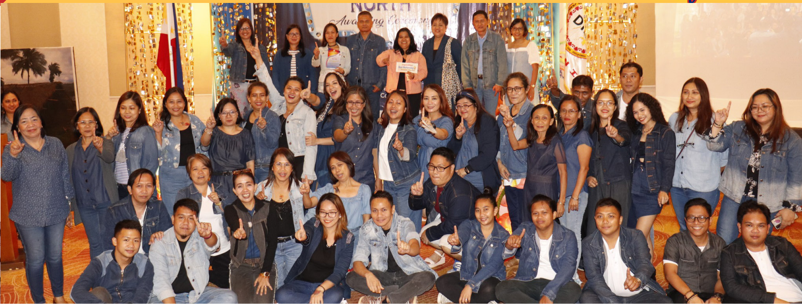
Jewels of the North 2022 : DILG LUPO: Best Performing Province