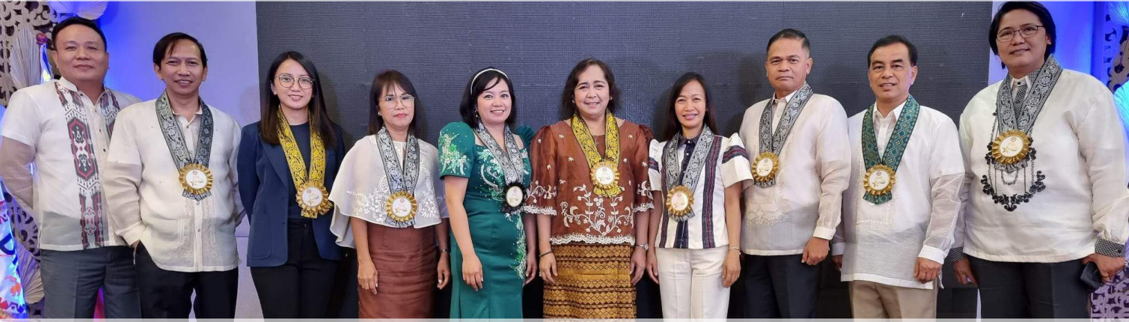
SubayBayani Awards 2022 : DILG Region 1: Best Performing Regional Office