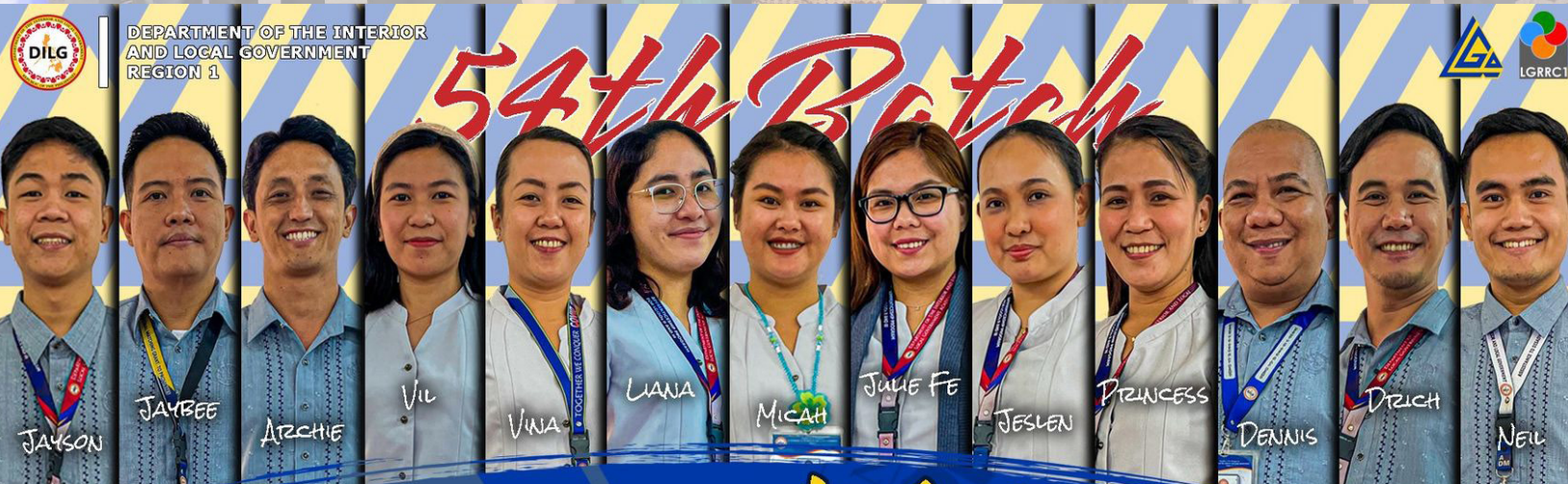
Batch 54 Sanliiyab: 13 Apprentices